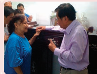
sis Tok Broke Off Contact with idols made by craftsmen